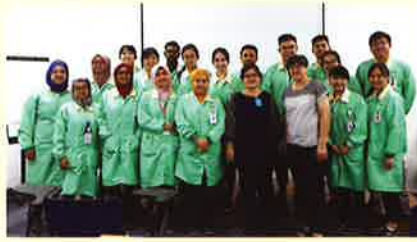
NationGate Solution (M) Sdn. Bhd.