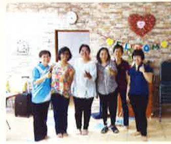
BCT Mod 3 team