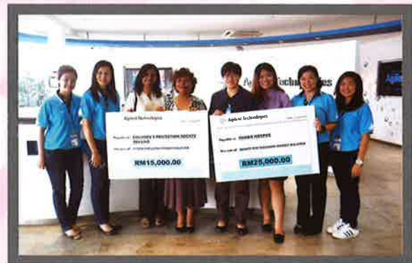
Group photo taken with Agilent team