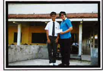
PR Manager receiving cheque from a student