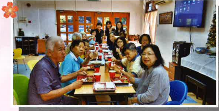
MAC patients enjoying lunch provided by Texchem Corporation

Charis Hospice would like to thank Texchem Corporation Ladies Club for arranging a lunch for the MAC patients at our premises during Chinese New Year. The team consists of seven ladies who represented the various subsidiaries of Texchem group. They spent the morning entertaining the patients by sharing with them about the history of Texchem, singing songs and playing games with them. The patients then were treated with a delicious Japanese lunch from Sushi King. Thank you, ladies for giving the MAC patients a wonderful time!