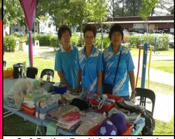
Craft Booth at True Light Baptist Church Christmas Carnival, 22th December 2013

CHEQUE PRESENTATION 29th January 2014 of RM 90,000